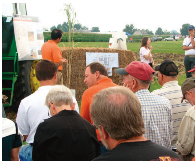
Biomass feedstock production session, Agronomy Day, University of Illinois.

The objectives of the Engineering Solutions program are being accomplished through five interrelated and integrated tasks: (1) pre-harvest energy crop monitoring, (2) harvesting of energy crops, (3) transportation of biomass, (4) storage of biomass, and (5) systems informatics and analysis. For each task, systematic approaches are taken to characterize task features, evaluate existing technologies, identify information